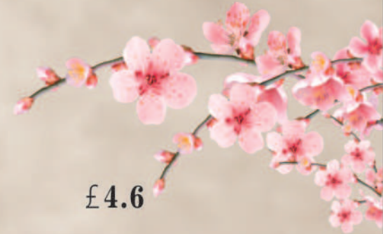
47 California Temaki £4.6 加州手卷