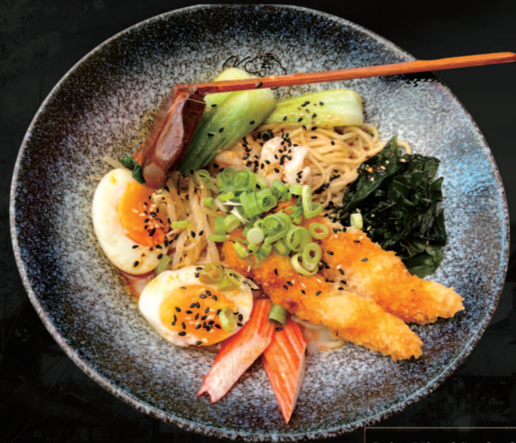
Spicy Mixed Seafood Ramen