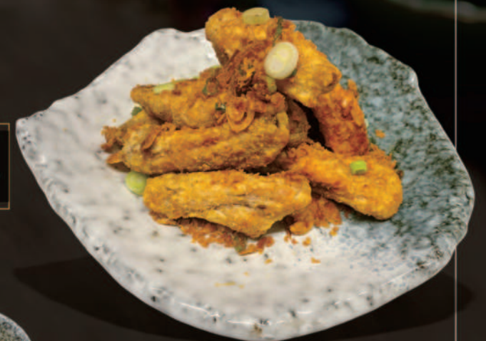
Salt and Pepper Chicken Wings (6pcs)