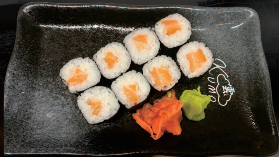
45 Salmon Hosomaki £4.8 三文鱼