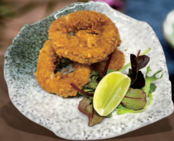
Deep Fried Squid Ring