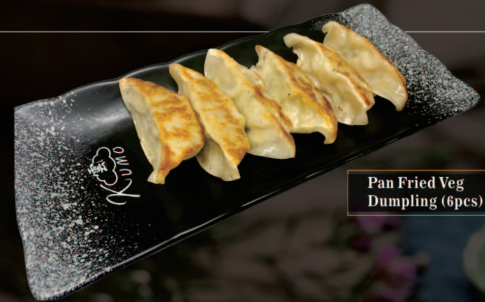
Pan Fried Veg Dumpling (6pcs)