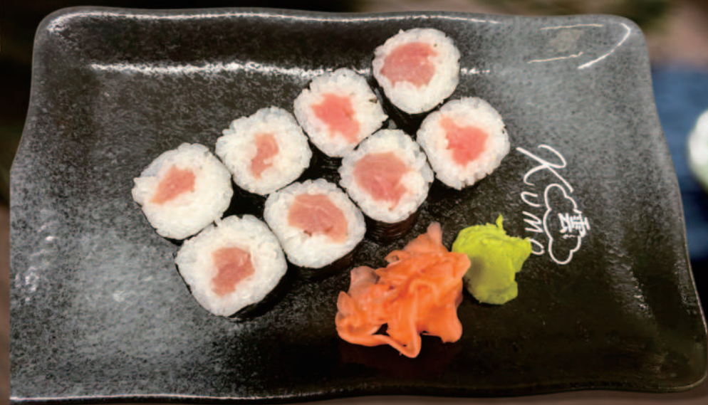
46 Tuna Hosomaki £4.8 吞拿鱼

The pictures of the menu are only for your reference!