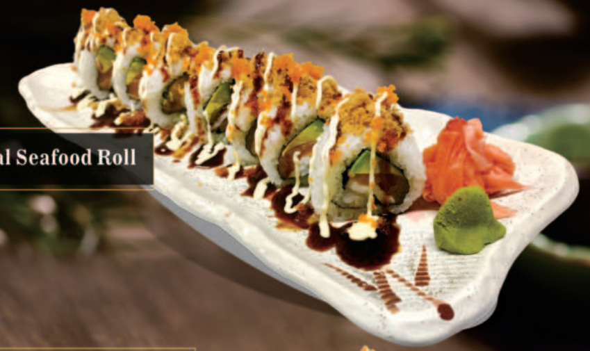
Special Seafood Roll