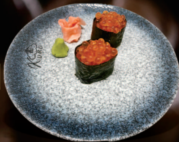
Ikura (Salmon Roe)