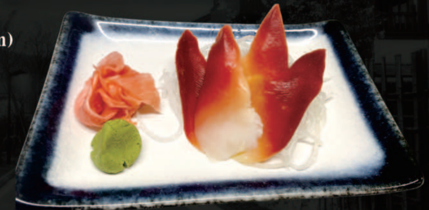
22 Hokkigai (Surf Clam) 北极贝 £5.6