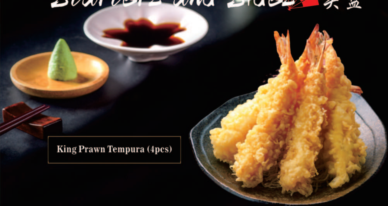
King Prawn Tempura (4pcs)