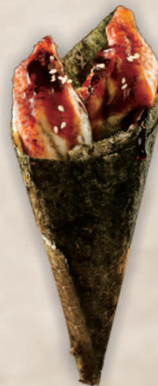
51 Eel and Cucumber £4.8 鳗鱼青瓜手卷