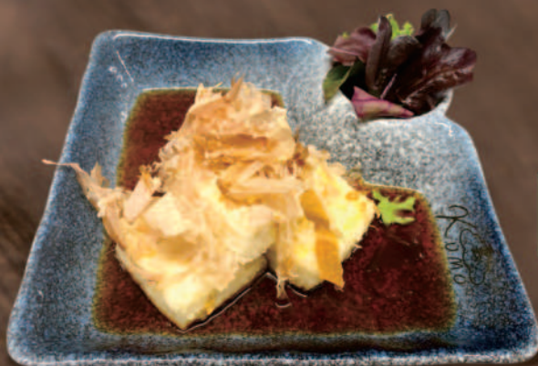
Age Dashi Tofu