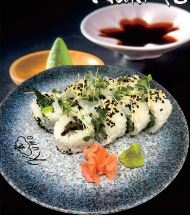
52 Green Veg Roll 素食卷 (Sushi roll filled with avocado, asparagus, pickled radish, lettuce, mayo rolled in sesame seeds and cress) £ 8.8