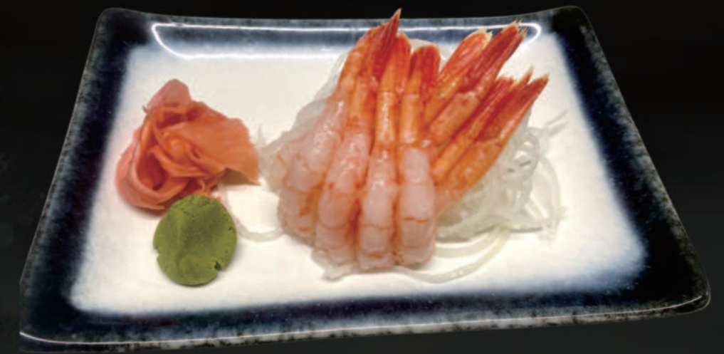
21 Ama Ebi (Sweet Shrimp 8pcs) 甜虾 £5.6