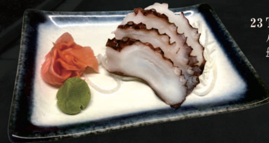
23 Tako (Octopus) 八爪鱼 £5.6